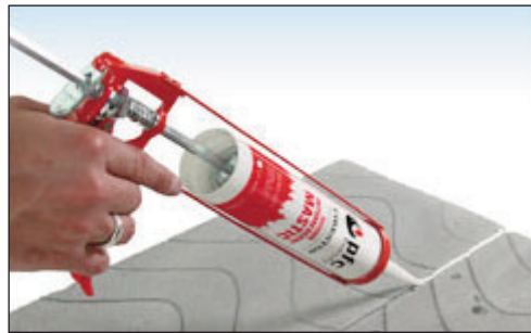
PFC Corofil Acoustic Intumescent Sealant in blockwork joints

In addition to the fire rating the sealant may be used to seal joints in party walls to provide an acoustic seal.